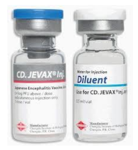
Fig. 2: Japanese encephalitis medication

There is no known specific therapy for Japanese encephalitis. Our treatment was symptomatic and supportive. The headache was managed with aspirin and codeine, while occasionally caffeine administered hypodermically seemed to give some relief. Procaine penicillinin oil, 300,000 units daily, was administered routinely to combat the secondary bronchitis and bronchopneumonia that appeared in the seriously ill patients. Fluid and electrolyte balance was maintained with intravenously administered fluids, whole blood, and vitamin supplements. The basic principles of nursing care were thoroughly exercised.